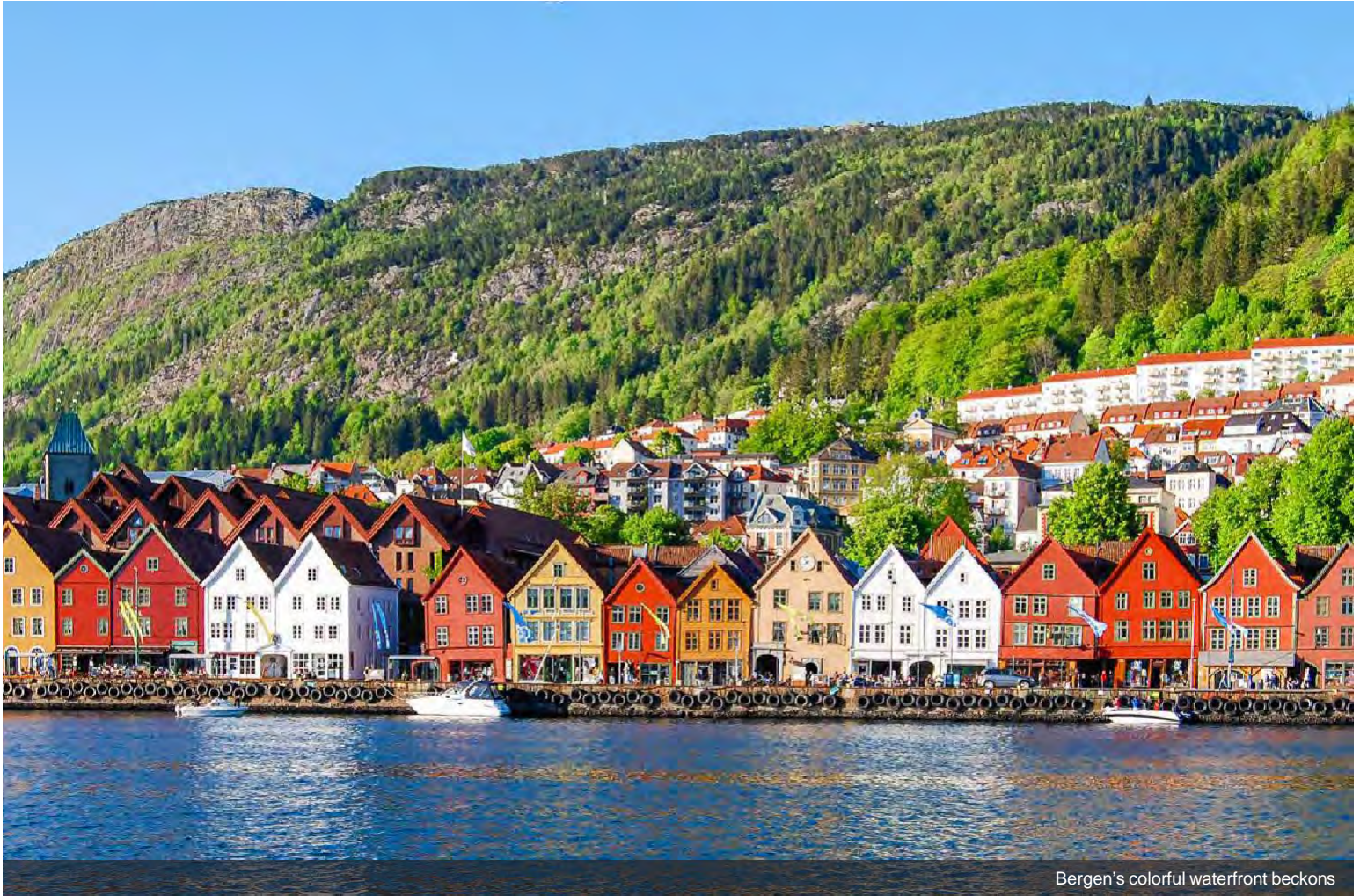
Bergen's colorful waterfront beckons