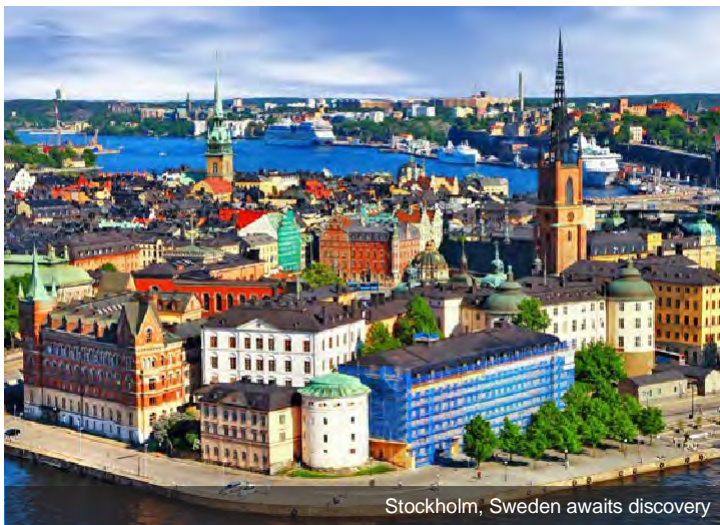
Stockholm, Sweden awaits discovery