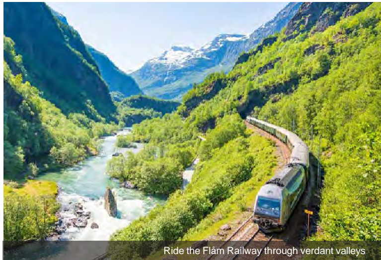
Ride the Flåm Railway through verdant valleys

DAY 1 Depart the USA: Today you'll depart the USA on your overnight flight to Stockholm, Sweden.