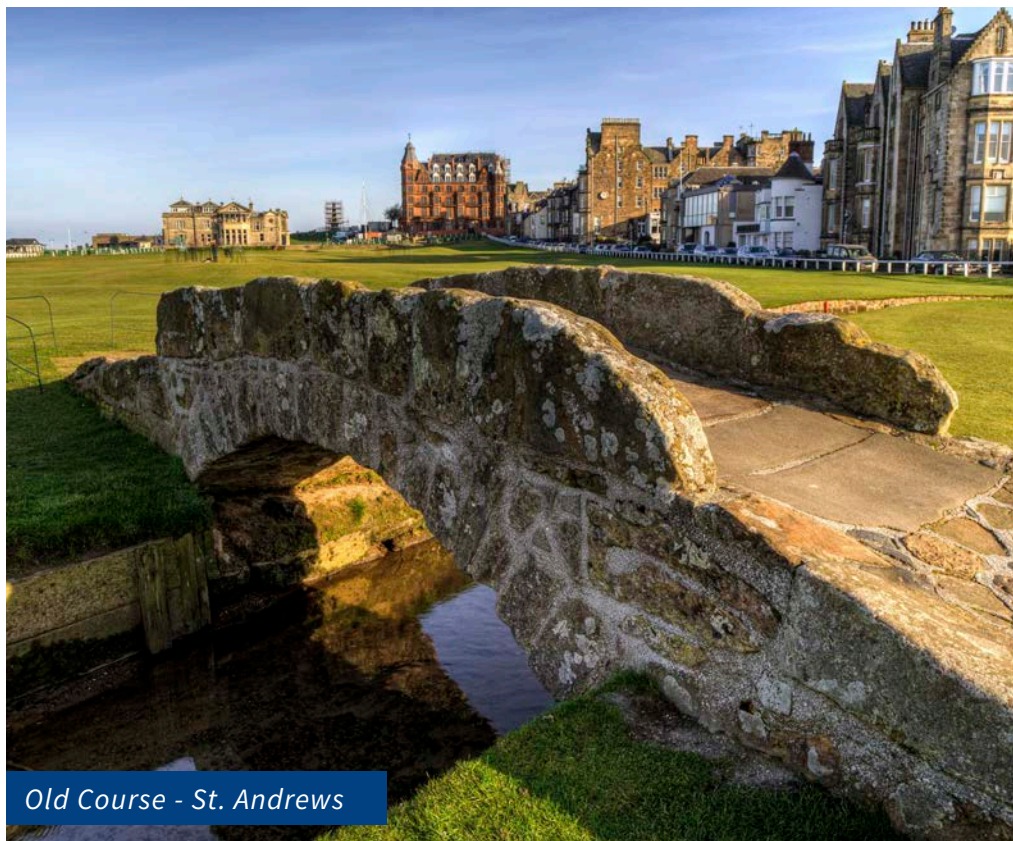
Old Course - St. Andrews

Art Gallery & Museum, one of Scotland's most popular museums. You will also visit Glasgow Cathedral of St. Mungo. Scots have been worshipping in this stone cathedral for more than 800 years. It is the best-preserved example of a large church to have survived from Scotland's medieval period. This afternoon, you'll have free time to shop on the world-famous Buchanan Street District or explore the city on your own. Tonight, be "treated like a local" enjoy dinner and drinks at a 200 year old pub on the River Clyde! (B, D)